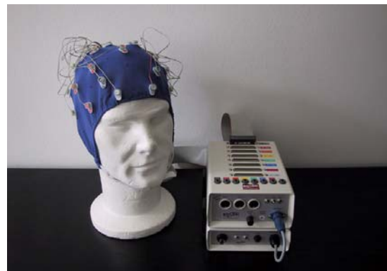
Figure 2. Portable EEG system used at the IDIAP Research Institute. It is a commercial BioSemi ActiveTwo system

EEG signals are acquired with a portable acquisition system such as the one shown in Figure 2. Subjects wear a commercial EEG cap with integrated scalp electrodes that cover the whole scalp and are located according to the 10/20 international system or extensions of this system to allow recordings from more than 20 electrodes (i.e., the 10/10 system)..