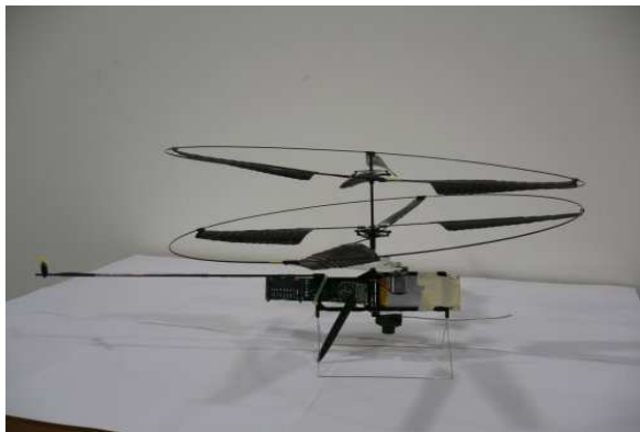
Figure 1: Proxflyer model retrofitted with new motors, SBC and miniature camera.

Both machines use two counter-rotating rotors, an arrangement in which the torque generated by one of the rotors is compensated by the second one, stabilising the yaw movement of the helicopter fuselage. These designs also have a higher efficiency than a traditional single rotor design; as a result the same power can be generated with a smaller diameter rotor, reducing the size of the vehicle.