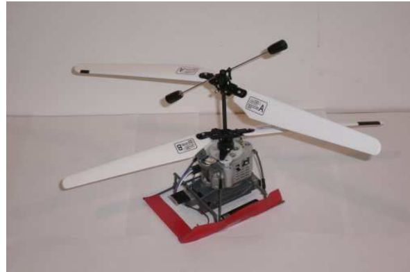
Figure 2: Hirobo XRB model

in an extremely stable flying machine that can hover hands-off if properly trimmed. However, the low forward speed and lack of lateral control are intrinsic drawbacks of the design.