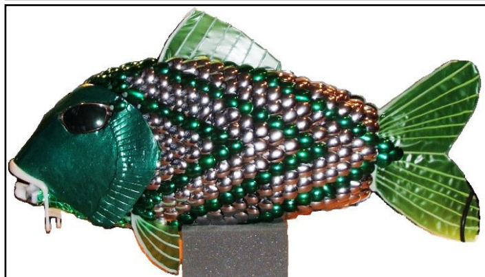
Figure 2 A robotic carp fish